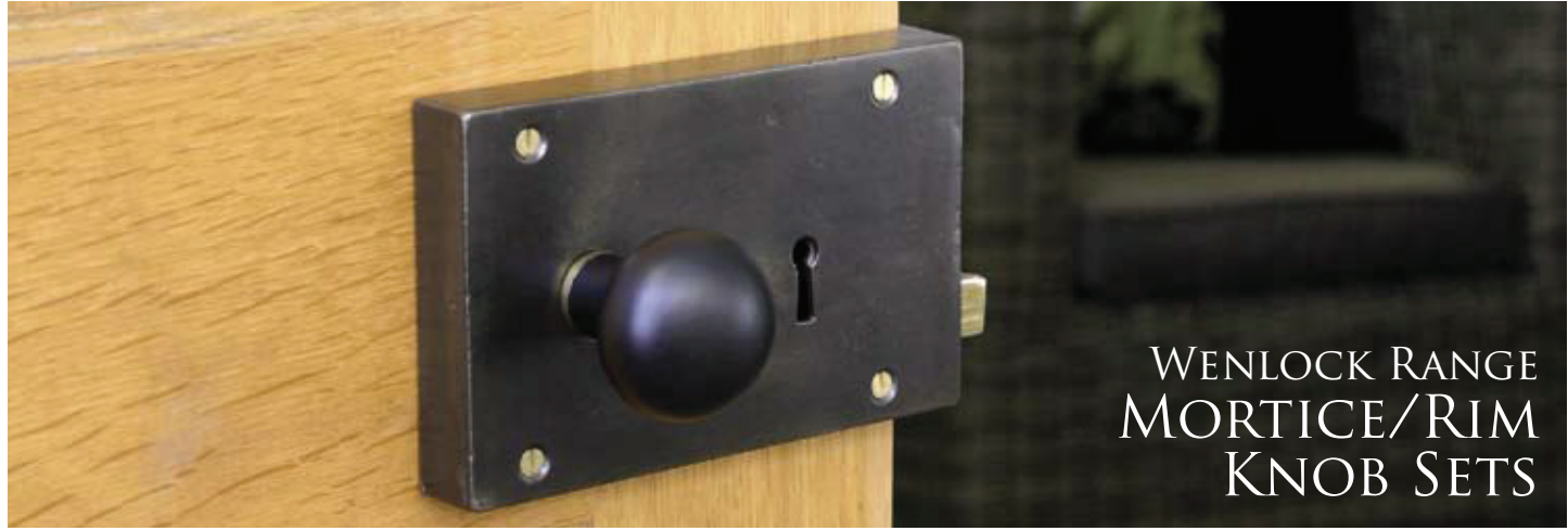
83563 (Bun Rim Knob) & 83591 (Left Hand Rim Lock)