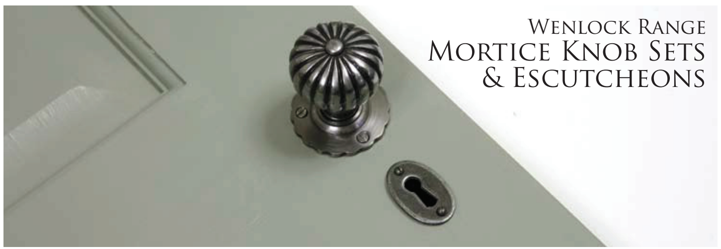
83561 (Flower Mortice Knob) & 33665 (Oval Escutcheon - Traditional Range)