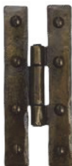
33914 - Bronze Finish