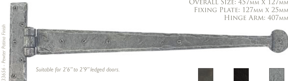
33656 - Pewter Patina Finish

OVERALL SIZE: 457MM X 127MM FIXING PLATE: 127MM X 25MM HINGE ARM: 407MM