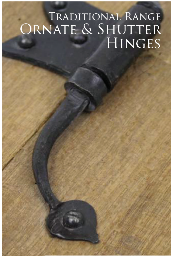
33213 (Shutter Hinge)