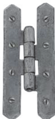
33628 - Pewter Patina Finish