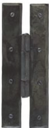
33181 - Beeswax Finish