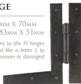
33257 - Beeswax Finish