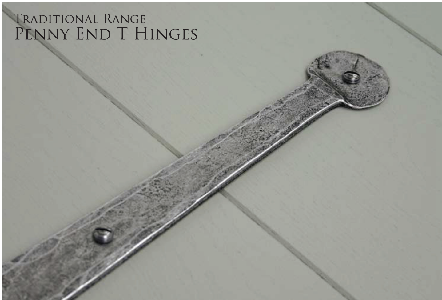
33656 (18" T Hinge)