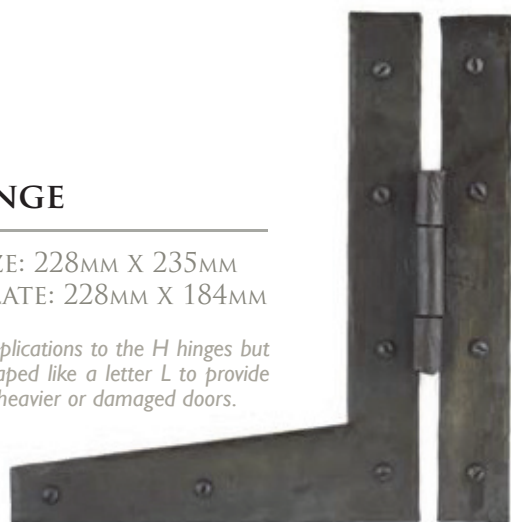
33183 - Beeswax Finish