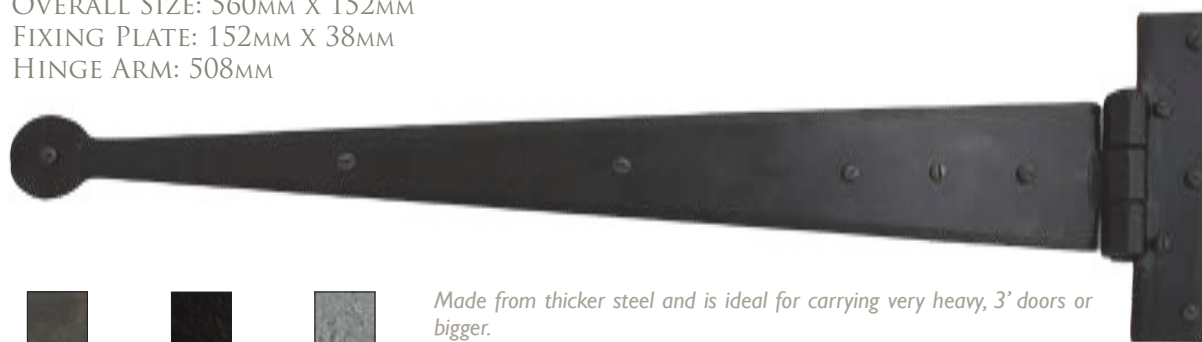
33012 - Black Finish

OVERALL SIZE: 560MM X 152MM FIXING PLATE: 152MM X 38MM HINGE ARM: 508MM